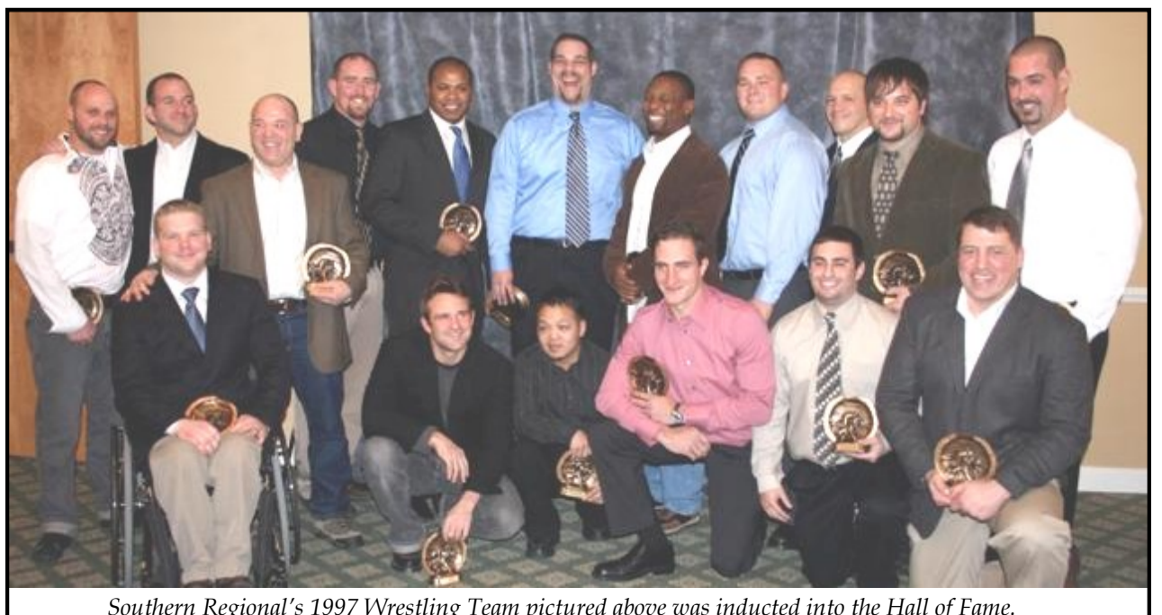
Southern Regional's 1997 Wrestling Team pictured above was inducted into the Hall of Fame.