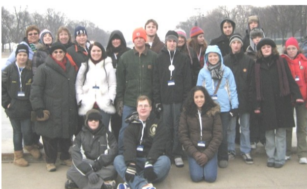
Earth Experience traveled to Washington D.C. for Presidential Inauguration.