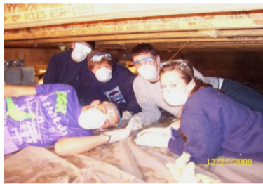
Members of the Campus Chapter of Habitat for Humanity.